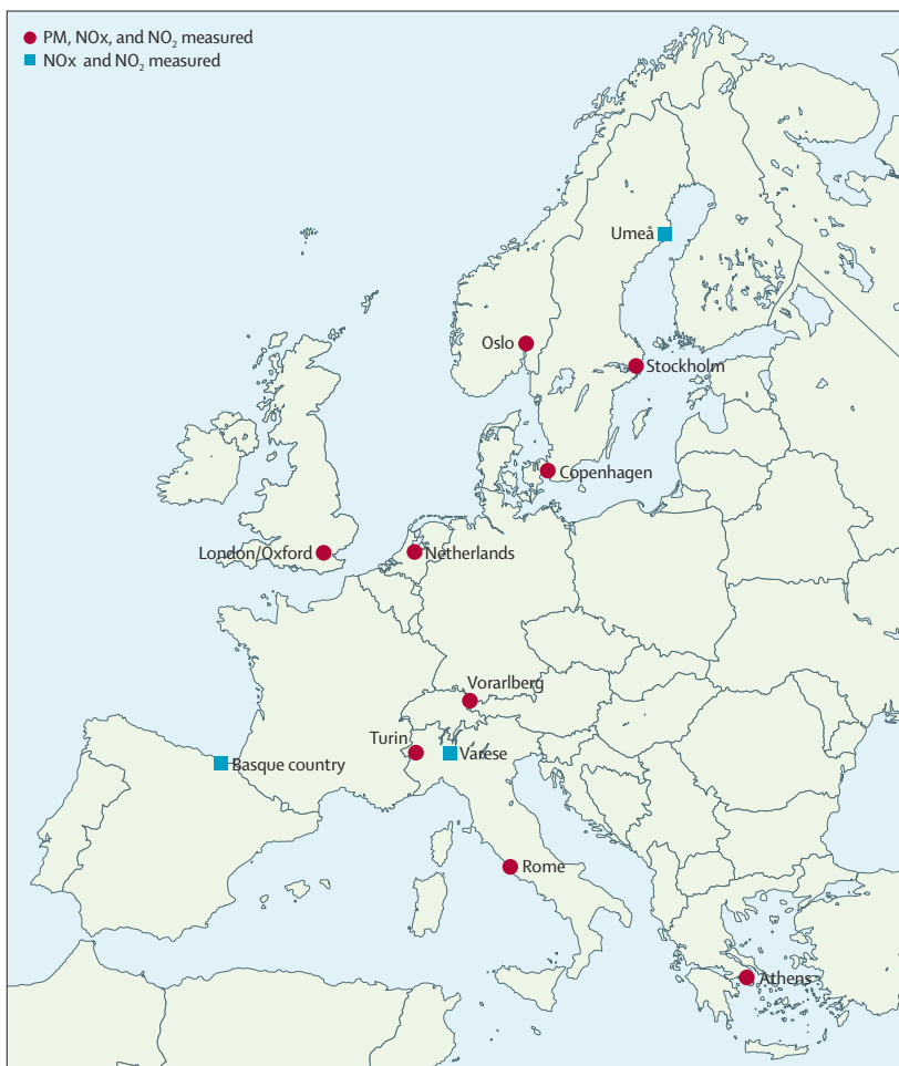
Figure 1: Areas where cohort members lived, measurements were taken, and land-use regression models for prediction of air pollution were developed NO x =nitrogen dioxide. NO x =nitrogen oxides (the sum of nitric oxide and nitrogen dioxide). PM=particulate matter.

Air pollution concentrations at the baseline residential addresses of study participants were estimated by land-use regression models in a three-step, standardised